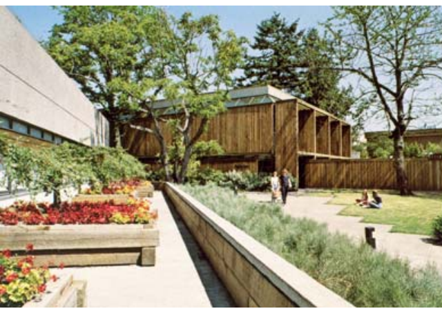
Rendering of the Current Facility