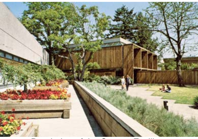
Rendering of the Current Facility