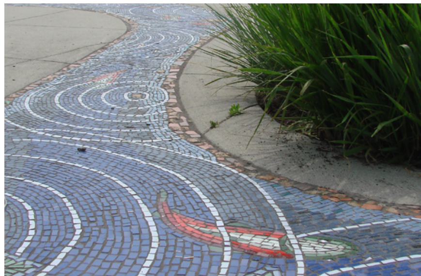
Coho Creek Bruce Walther

It may be possible to use the wall for mosaics as well.