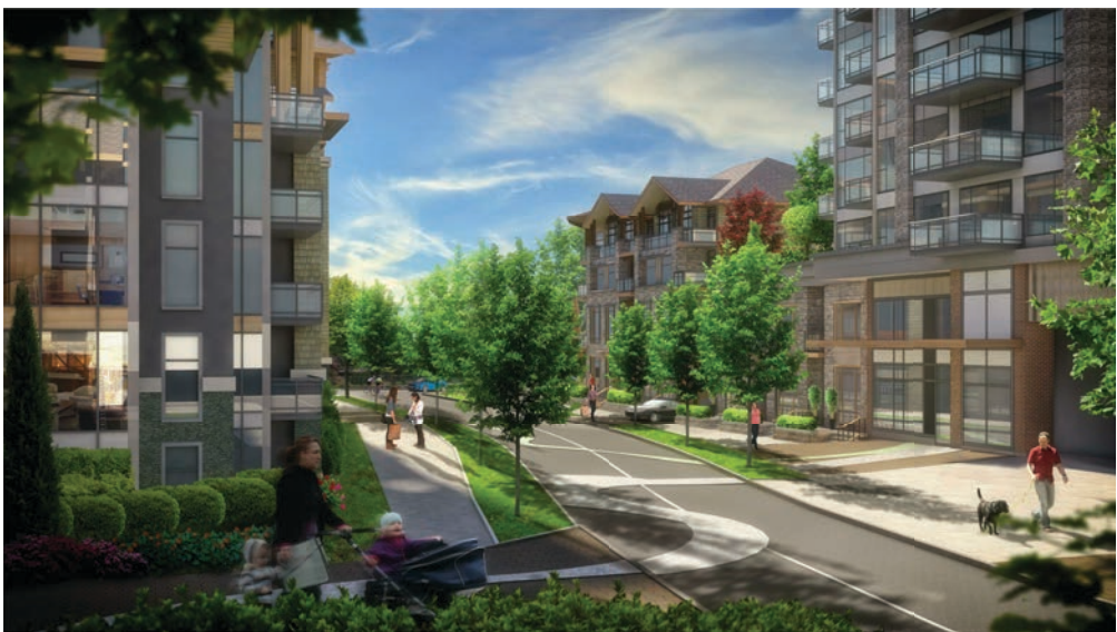
Looking south on Library Lane