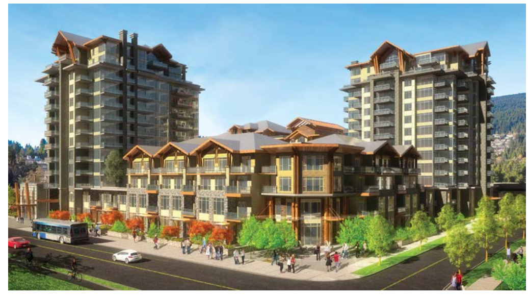
Corner of East 27<sup>th</sup> Street and Library Lane