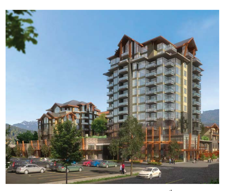
Corner of Valley Centre Avenue and East 27<sup>th</sup> Street

By the 1990s, public art had evolved far beyond the lonely monument on an open plaza. Now public artists might design the entire plaza, create an event to alter the social dynamics of an urban environment, or help to reconstruct a neighborhood.