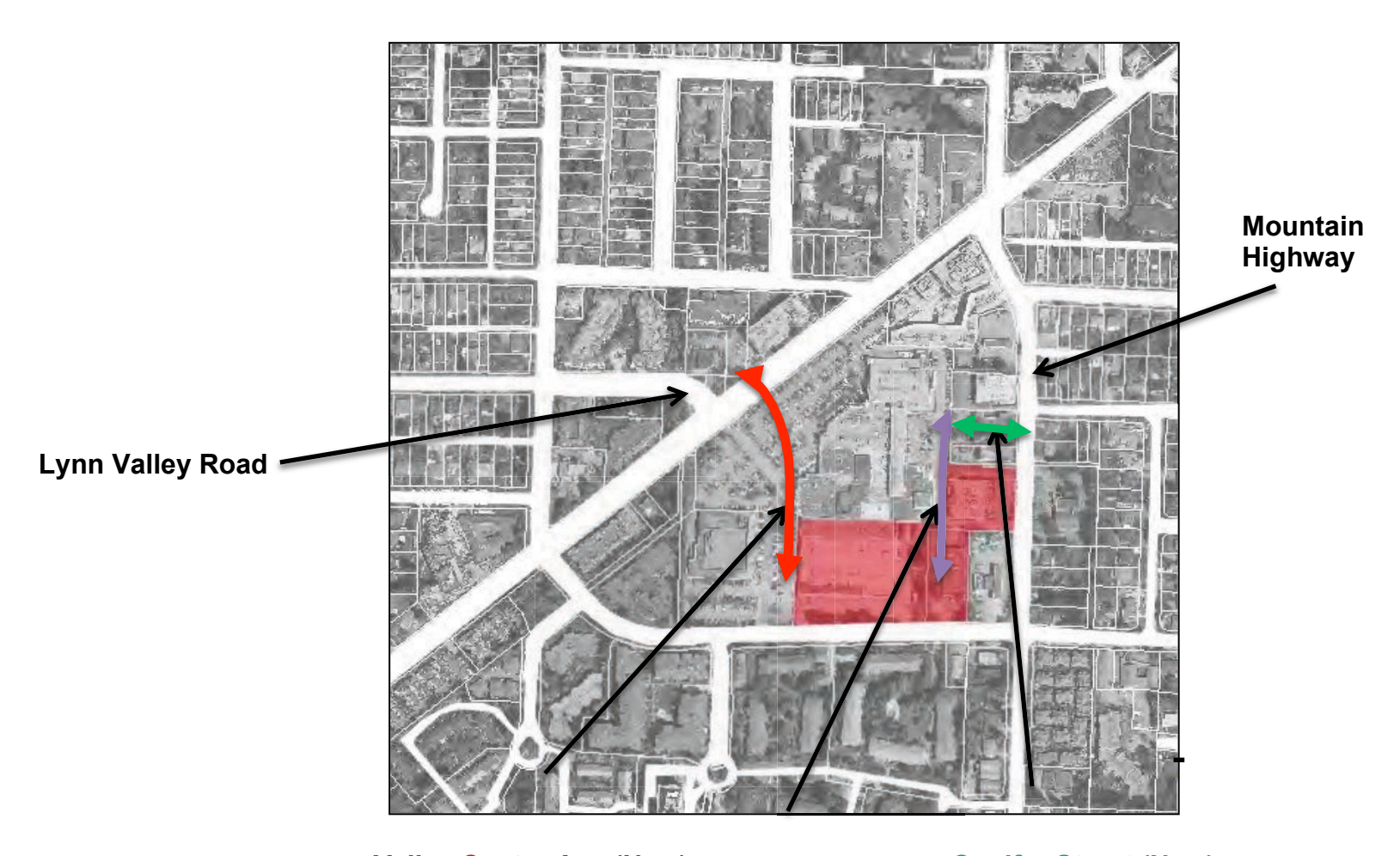
Valley Centre Ave (New)