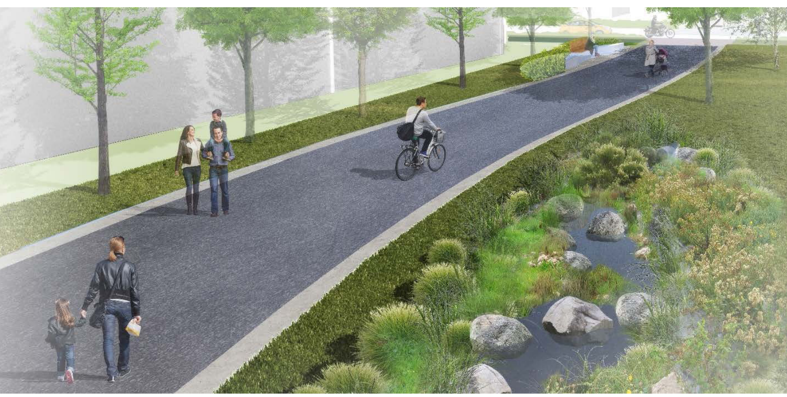
Green Spine Conceptual Design, District of North Vancouver, Rendering

Pivot Adera Projects Ltd., in partnership with the District of North Vancouver, invites expressions of interest from professional artists or artist teams to create a public artwork at the entrance to the south section of the District-planned Green Spine linear park as part of the Pivot development project in North Vancouver's evolving Lynn Creek Town Centre. Situated within the Green Spine and reflecting the area's unique qualities, the public artwork will energize the public realm and contribute to the vitality of this emerging community.