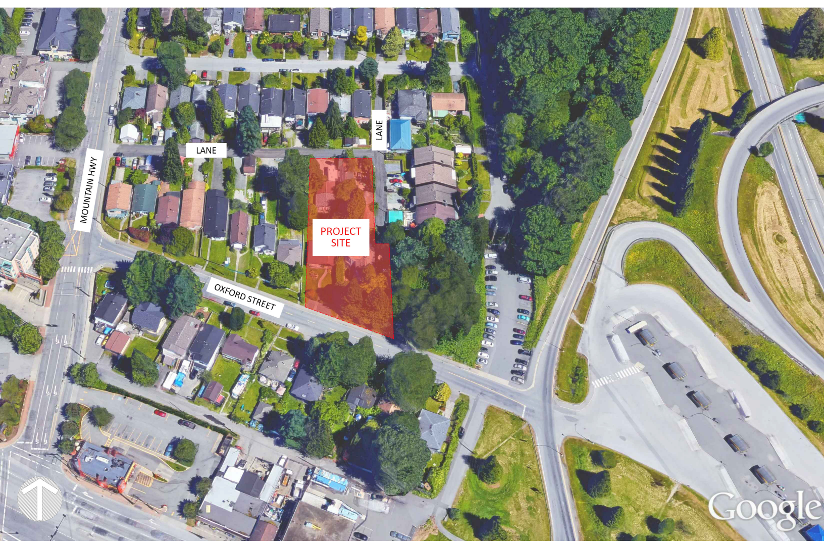
Context Map showing Pivot site location within Lynn Creek Town Centre, District of North Vancouver