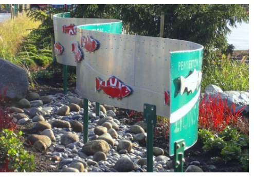
Phillip & Kirsty Robbins, Salmon Crossing, 2007