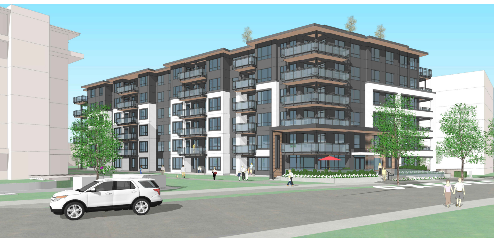
Perspective view of Adera Pivot + entry point to the Green Spine linear park looking northeast from Oxford Street, District of North Vancouver, Rendering

Pivot is a six-storey, multi-family market rental development located on the north side of Oxford Street within the developing Lynn Creek Town Centre in the District of North Vancouver, envisioned as a well-designed pedestrian, bike, and transit-oriented mixed use community at the gateway to the District that celebrates the region's natural setting. Significantly, the project will contribute rental housing to the community, fulfilling the vision outlined in the Official Community Plan for Lynn Creek Town Centre to provide a wide range of housing types for people of all stages of life and incomes, promoting social interaction and ensuring a healthy demographic mix. A well-designed residential building with indoor and outdoor amenities, inviting public spaces, and a revitalized streetscape, Pivot will create a welcoming, family-friendly atmosphere for this emerging community.