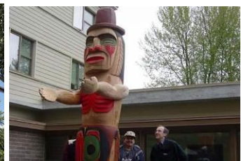
Return of the Spawning Salmon, Gateway to Ancient Wisdom, Welcome Figure Coast Salish art installations in the City of North Vancouver

Submission Deadline: April 28, 2014 @ 4 pm