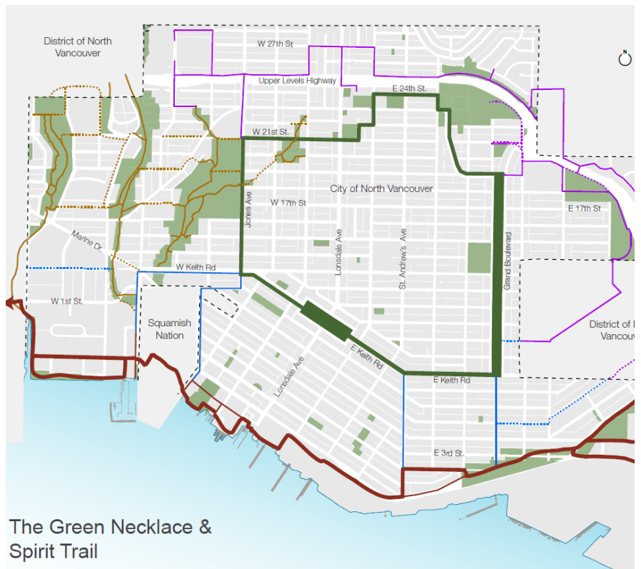
The Green Necklace & Spirit Trail

Based on a vision outlined in the City's original 1907 town