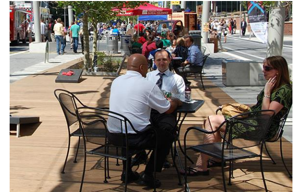
The District of North Vancouver is comprised of a network of town and village centres:

The District has a thriving Public Art Program that consists of a wide ranging selection of artworks that are both sculptural and integrated into the landscape. Each piece is site specific, conveying interesting local stories about community aspirations, environmental splendors and vibrant local culture. Artwork in this growing collection can be found along nature trails and public walkways, in parks, plazas and civic buildings, marking gateways and animating streetscapes. North Vancouver's public art collection can be viewed at www.nvrc.ca/arts-culture/public-art/art-collection .