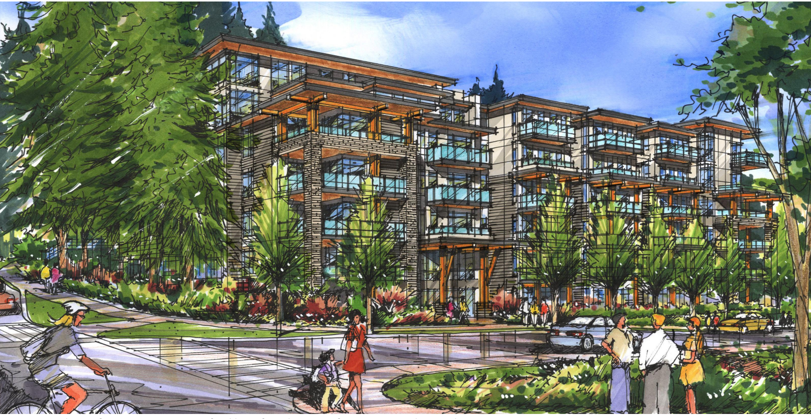
Rendering of Seymour Estates: View of Building 1 from the corner of Mt. Seymour Parkway and Lytton Street

Located at the junction of Mt. Seymour Parkway and Lytton Street in the District of North Vancouver, Seymour Estates is seen as a socially connected, family-oriented community which embraces its location. The harmoniously designed mixed-use residential buildings sit on a 2.54ha site, nestled within a bright enclave between existing neighbourhoods, parks and greenspaces. The Seymour Estates development invites a broad community demographic and includes both dedicated market rental and below market rental housing. Seymour Estates' well-designed residential buildings feature indoor and outdoor amenities which include four communal, family-oriented outdoor spaces, promoting informal outdoor play and create a socially connected neighbourhood.