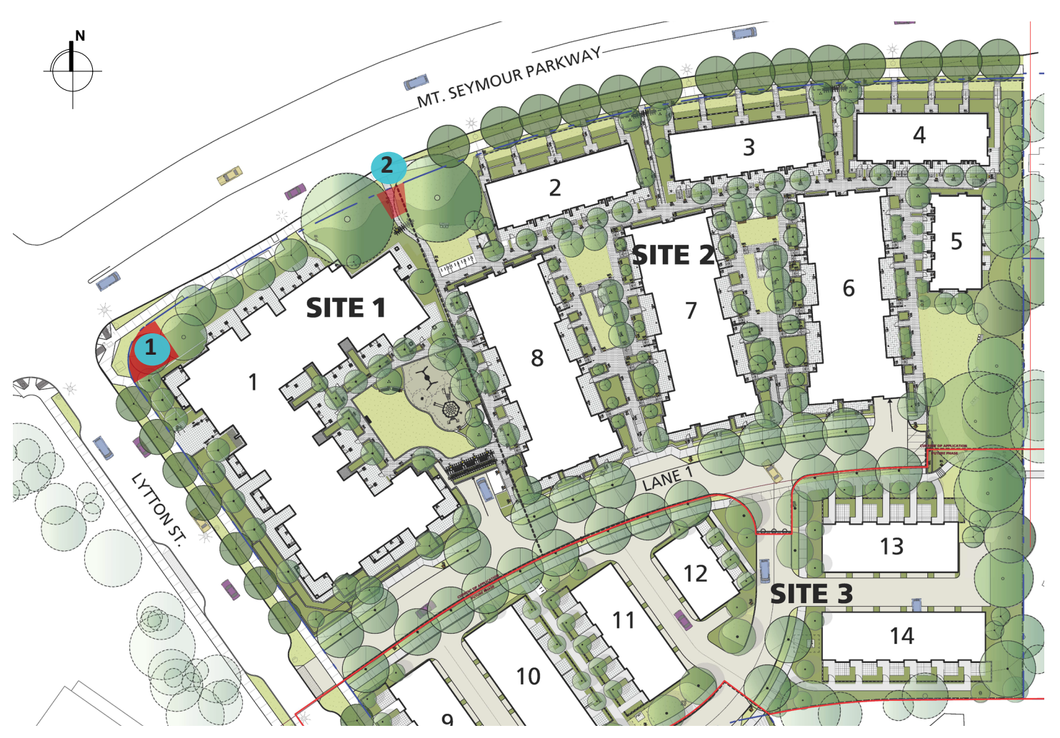
Landscape Plan of Seymour Estates

Public Art Opportunity #1 – Primary Site at Mt. Seymour Parkway and Lytton Street