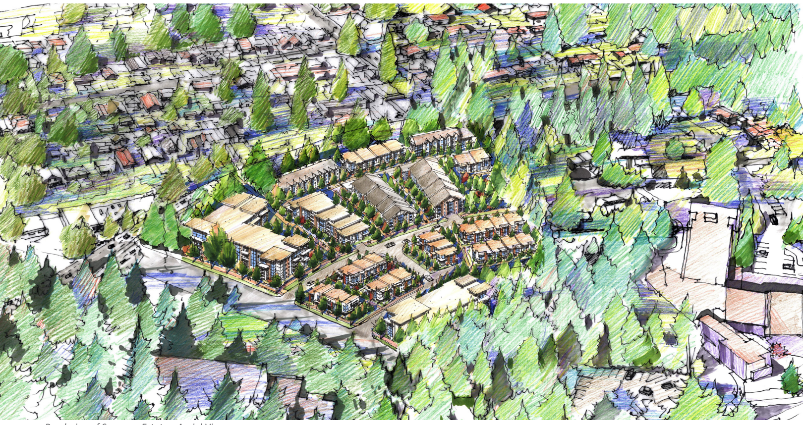
Rendering of Seymour Estates: Aerial View

Anthem Properties, in partnership with the District of North Vancouver, invites expressions of interest from professional artists or artist teams to create a public artwork at the entrance to Seymour Estates community at Mt. Seymour Parkway and Lytton Street. There is potential for the public artwork to extend westward with a secondary artwork fronting Mt. Seymour Parkway at the pedestrian pathway. Situated within a publicly accessible space and reflecting the area's unique qualities, the public artwork will energize the public realm and contribute to the vitality of this emerging community.