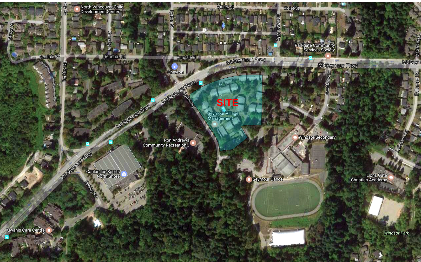
Aerial map showing the Site within the North Vancouver context