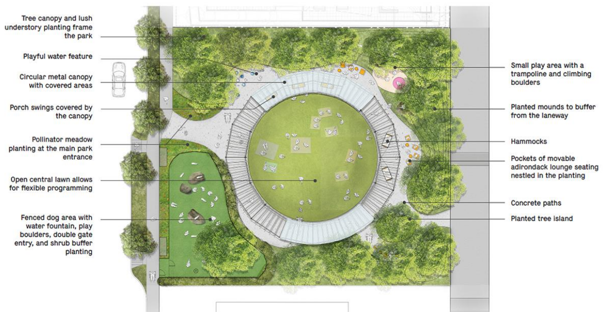
Final concept plan: Source Happa Collaborative

This public art opportunity focuses on Eastern Park, construction anticipated to start in 2024. This is a brand new park. The park design, presents an oasis of calm in the urban core of the City. The park features a circular metal canopy with sections of covered areas that will provide sun and rain protection. Porch swings and hammocks hang from the trellis structure with pockets of seating areas around the edges of the park. An open area in the center will allow for flexible park activities. Playful elements include a water feature, small in ground trampoline and climbing boulders. A pollinator meadow frames the entrance to the park and the fenced dog area. More information about the park’s planning and design can be found at www.cnv.org/1600Eastern