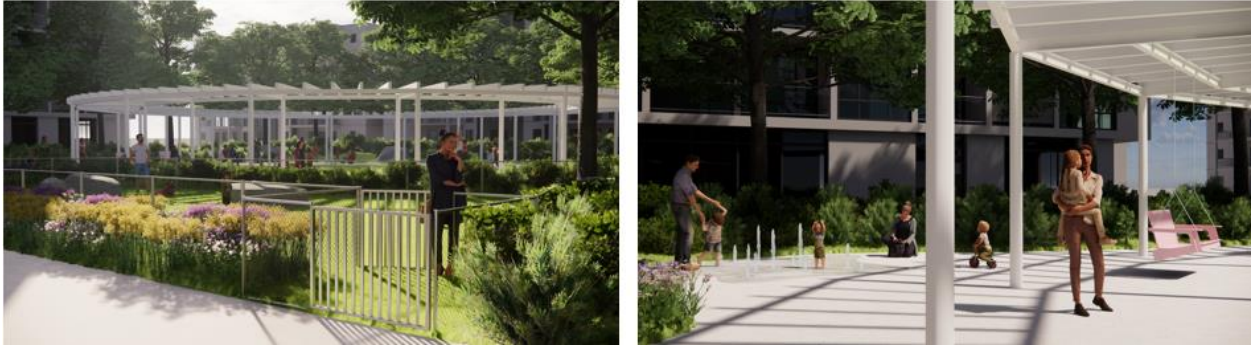
Concept Renderings: view to off leash area & view under canopy to water feature