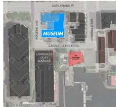
Location of new museum (100 block W. Esplanade)