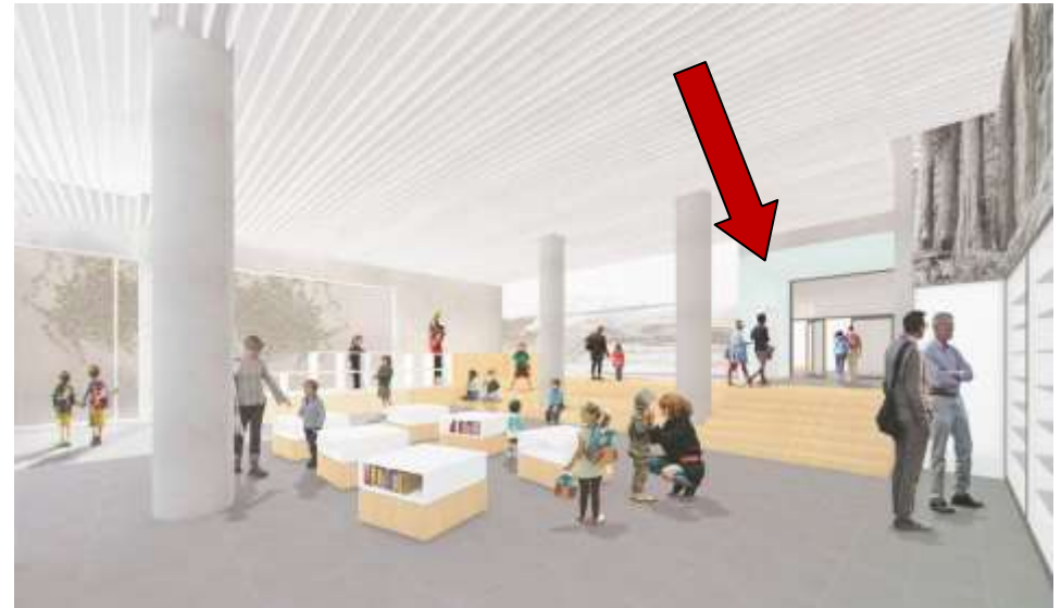
Above: Preliminary architect's concept Entrance lobby with museum entrance at upper right.

More information about the new museum can be found on the website of the North Vancouver Museum & Archives ( nvma.ca ).