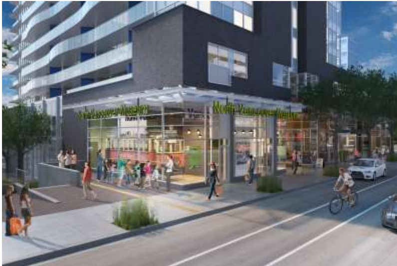
View toward entrance lobby of the new North Vancouver Museum (100 block West Esplanade) situated in the retail/residential complex 'Promenade at the Quay' being developed by Polygon Homes.