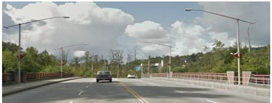
Port Coquitlam, BC

As Keith Road Bridge spans Lynn Creek a popular recreational destination, it is anticipated that there will be improvements made to the pedestrian pathways on the underside of the bridge. Given that these pedestrian routes are well used by the local community, the abutments may be considered for a creative intervention.