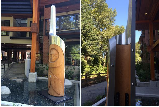
Artwork located at a nearby residential complex (Reflections: i.e. Creative & Honouring Our Cedar: John Marston)

This public art call for expressions of interest focuses on a 65ft x 8ft cement wall located under the 2<sup>nd</sup> Street Bridge. The municipality is seeking a public artwork that will both add character to the location and serve as a deterrent to vandalism and tagging in the future.