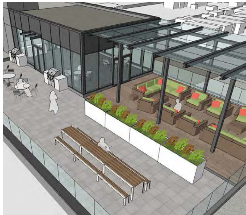
Rendering of resident lounge space