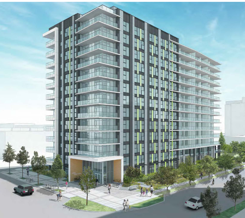
View of main entrance 1600 Eastern

The building form takes shape as a thirteen-storey slab block. A double height entrance lobby is sited towards the north end of the tower to anchor the building and to respond to the corner condition of Eastern Avenue and East 17th Street. Adjacent to the lobby is the main circulation core, allowing the main entry to flow easily, connecting to the convenience of nearby shops and transportation on Lonsdale Avenue. Amenity spaces are also located adjacent to the main building entry for accessibility and convenience. In addition, the design proposes a multi-purpose lounge space on the roof level for socializing and gathering. This significant open lounge space will have immediate access to the outdoors, taking advantage of sweeping views to the mountains and waterfront, as well as excellent access to daylight and natural fresh air. The park is planned on the south end of the development, mid-block of Eastern Avenue, complementing the redevelopment of the site.