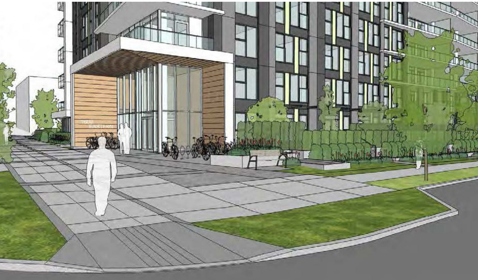
Rendering of 1600 Eastern at corner of Eastern Ave and 17th Street

1600 Eastern is envisioned as a warm and animated community environment. Designed to foster and enhance vital community interaction, special attention has been placed on the development's four edges to ensure the relationship between the building, street and surrounding public realm flourishes. Creating an engaging backdrop for everyday life as well as eyes on the street, 1600 Eastern will create welcoming and safe ground-oriented street frontages with generously paved pedestrian pathways, wider sidewalks and added street trees. This dynamic area is in constant motion with the activities of residents, workers, and shoppers animating the public spaces beyond business hours creating a safe, popular and accessible mixed-use neighbourhood. 1600 Eastern is located in close proximity to the key street of 13th, a throughway hosting a dedicated bike lane as well as numerous connections to other nearby destinations and greenspaces. With significant impact on the surrounding area, 1600 Eastern will have a transformative effect on the day-to-day lives of Central Lonsdale inhabitants.