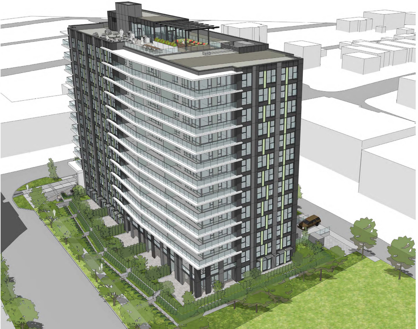
Bird's eye view of the development's design

1600 Eastern is a 13-storey, transit-oriented, residential mid-rise development with 225 dedicated rental units. Located within North Vancouver's dynamic Central Lonsdale neighbourhood, at the corner of 17th Street and Eastern Avenue, the development features 154,414 sf, with 3000 of common building amenity space as well as extensive indoor and outdoor amenity areas. Uniquely, approximately 40% of the site has been set aside for a proposed public park, totaling over 18,000 sf. Anthem properties is committed to building a highly-accessible, livable, welcoming and family-friendly development within this dynamic and evolving neighbourhood, befitting the site's important location within Central Lonsdale.