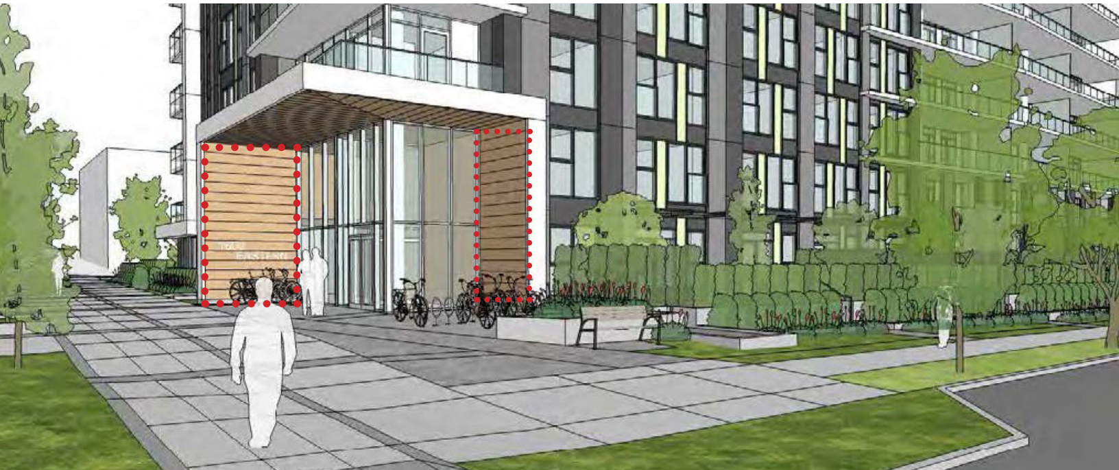
Public art opportunity, highlighted in red, corner of Eastern and 17th Ave

The Eastern design team and art consultant met to consider several possibilities for the Eastern public art opportunity. Following detailed site analysis, the prime site location has been identified as the exterior walls of the building entrance at corner of Eastern Avenue and East 17th Street, with the potential for an expanded series or sequence of related artworks at the open green spaces along Eastern Ave, towards the new proposed public park. The exterior wall running north-south, on 17th north side of the building, measures 10' 3 1/2" and the exterior wall running east-west, west side of the building, measures 8' 2 1/2". The landscape area running along Eastern Ave on private land is approximately 16' deep. The distance between stairs is 25'.