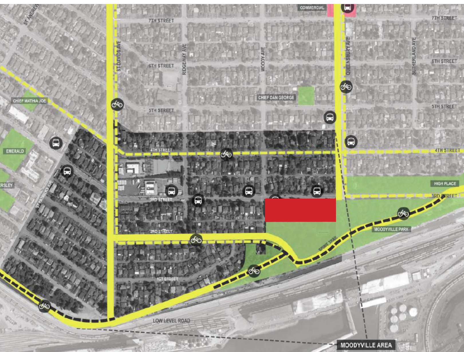
Green on Queensbury site highlighted in red