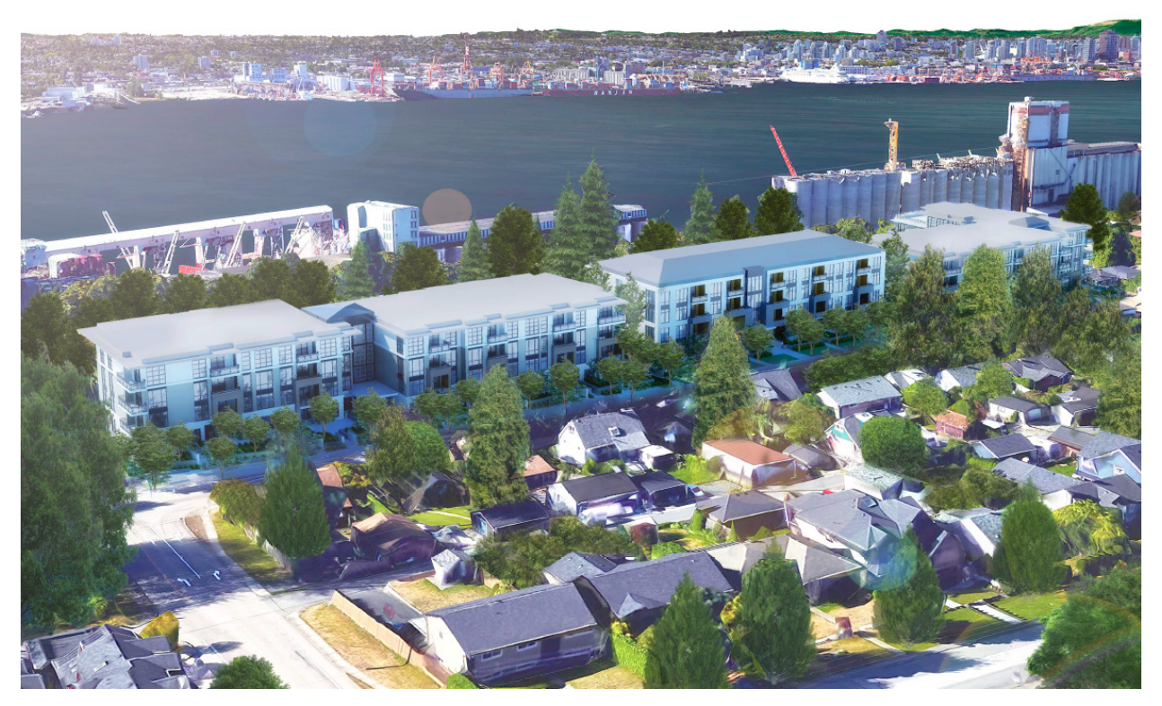
Green on Queensbury by Qualex - Landmark 700 Block, East 3rd Street, City of North Vancouver