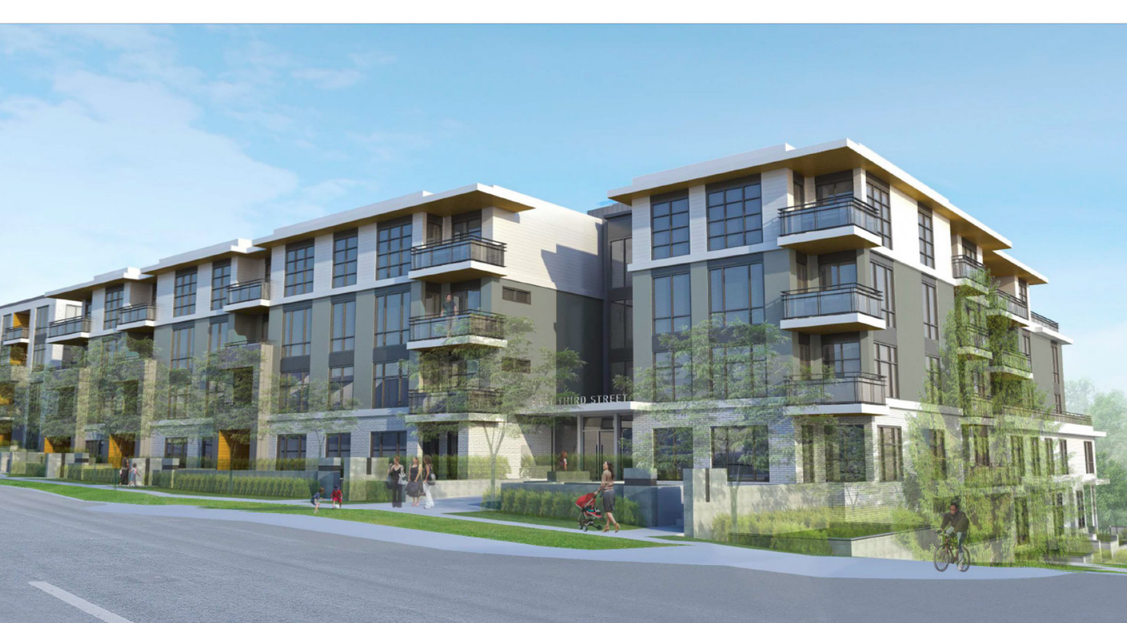
View of Green on Queensbury from the west

Green on Queensbury is inspired by the master planned enhancement of Moodyville Park, envisioned as a "natural setting with opportunities for play, discovery and art throughout" (City of North Vancouver, 2016). The expansive public greenspace, composed of picturesque garden vistas, natural children's play areas, multi-use connecting trails, and specialized activity areas to promote both tranquil and social moments, will greatly enhance the Moodyville community. Prioritizing community involvement, environmental awareness, and Moodyville's dynamic history, the new vision for Moodyville Park supports the park and outdoor recreational needs of the Lower Lonsdale and Moodyville community. Green on Queensbury, and the adjacent Moodyville Park, will foster community connectivity and provide a retreat that feels miles away from the busy city hum.