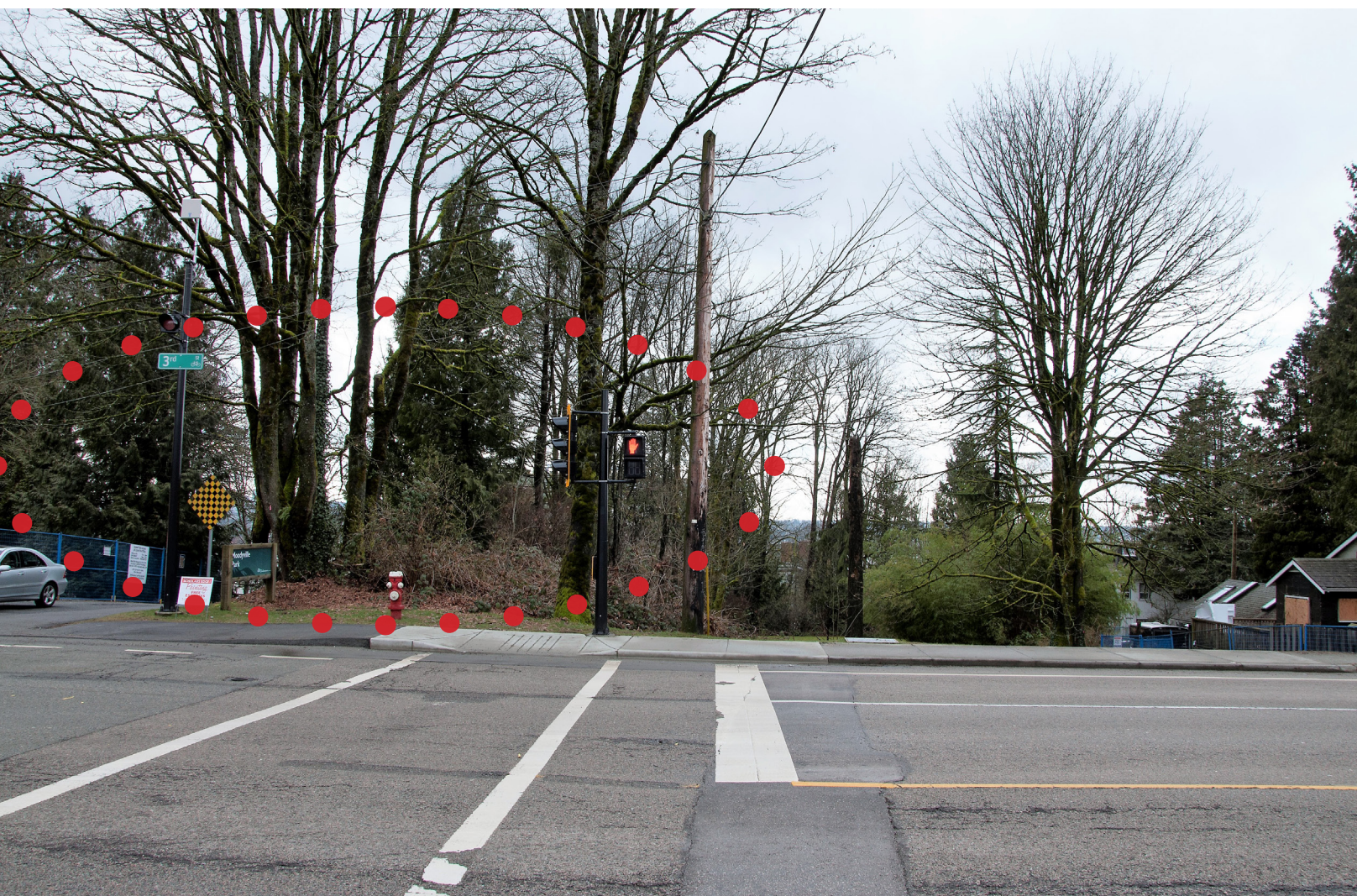
Crosswalk across 3rd Avenue on Queensbury, towards future public art opportunity

The architecture, landscape design and natural environment of the Moodyville Park setting invites artistic expression. The chosen artist will be given as much creative license as possible to develop a theme that reflects the Moodyville neighbourhood context and history while respecting the site and its use. Artists will be encouraged to conduct their own research of the Moodyville community in developing a proposal for an artwork that will have significance and layered meaning supporting longevity.