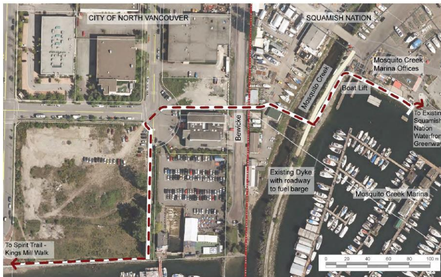
Plan View – Proposed Trail Alignment