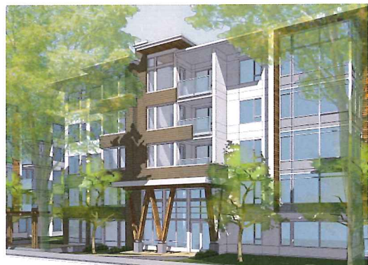
Residential entry on West 1 st Street