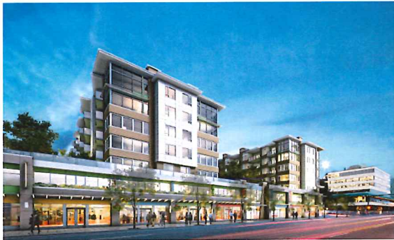
Rendering of “West Quay” development

The Polygon family of companies is among the most well-established and highly respected group of home builders in British Columbia. Polygon has a long history of integrating distinctive and high-quality public art in the creation of our communities. It is a means to showcase the outstanding work of local artists and to create a “sense of place” that contributes strongly to neighbourhoods.