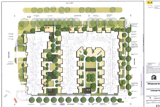
Site plan of "West Quay" development