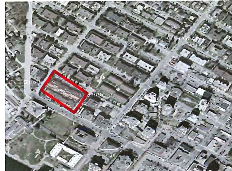
Site location within Lower Lonsdale

The “West Quay” site is in the westerly portion of Lower Lonsdale bounded by West Esplanade on the south, West 1 st Street on the north, Mahon Ave on the west, and Semisch Ave on the east.