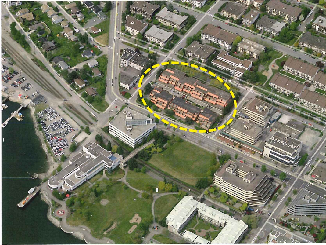
Aerial view of the site location circled in yellow within Lower Lonsdale