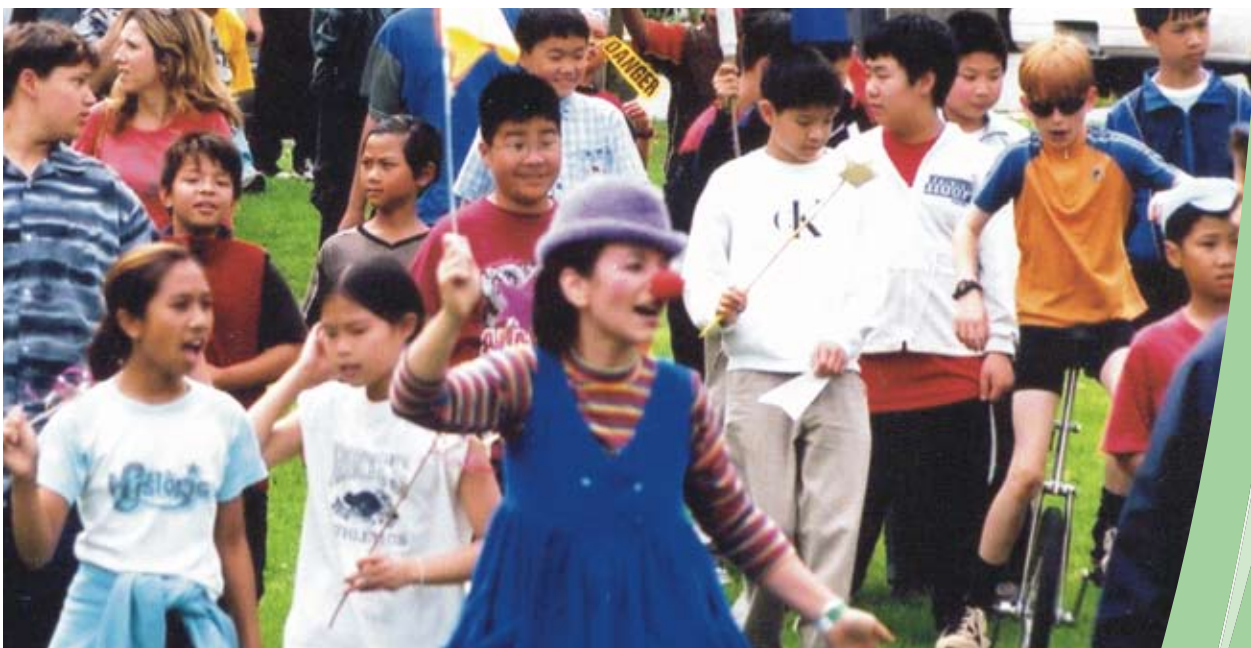
Circus of Dreams, 2001 (Vancouver) Public Dreams Society

Cultural planning is a way of looking at all aspects of a community's cultural life as community assets. Cultural planning considers the increased and diversified benefits these assets could bring to the community in the future, if planned for strategically. Understanding culture and cultural activity as resources for human and community development, rather than merely as cultural "products" to be subsidized because they are good for us, unlocks possibilities of inestimable value. And when our understanding of culture is inclusive and broader than the traditionally Eurocentric vision of "high culture," then we have increased the assets with which we can address civic goals.